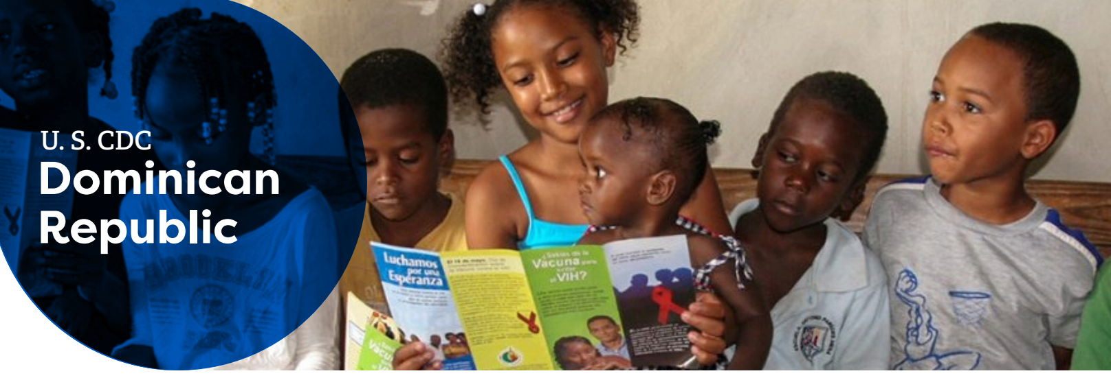
Accessible link: https://www.cdc.gov/global-health/countries/dominican-republic.html

CDC Dominican Republic (DR), established in 2009, works with the Ministry of Health (MOH) to build and strengthen the country's core capabilities. These include data and surveillance; laboratory capacity; workforce and institutions; prevention and response; innovation and research; and policy, communications, and diplomacy. Program areas address HIV and tuberculosis (TB), global health security, and emerging diseases.