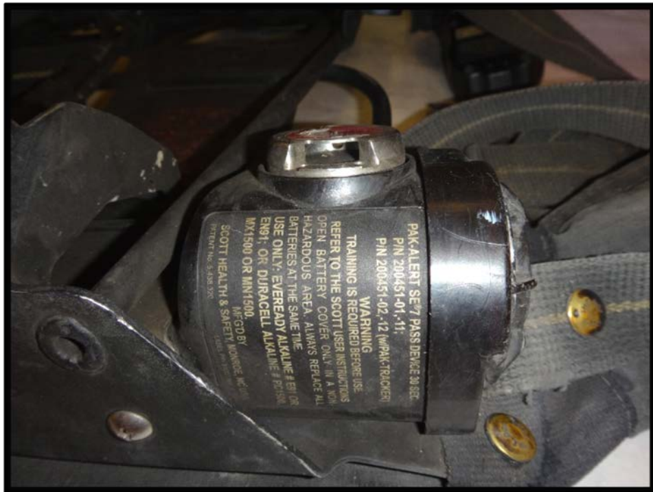
Figure 26: PASS control module