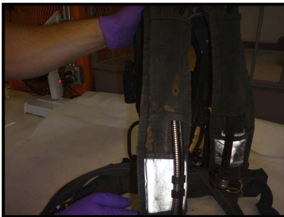
Figure 34: Shoulder straps have signs of heat damage