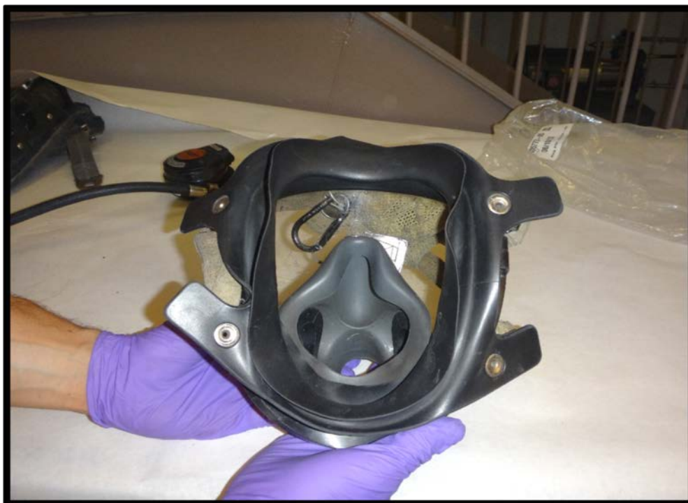
Figure 8: Inside of nose cup