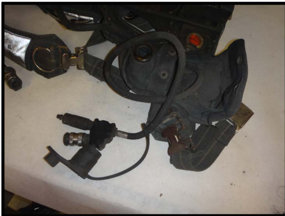
Figure 39: Auxiliary hose assembly in good condition