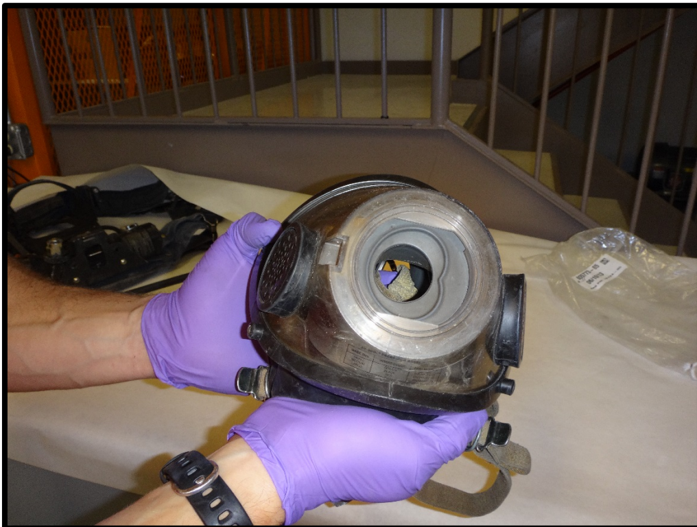
Figure 10: Port for second stage regulator