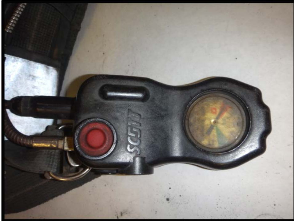
Figure 23: PASS console