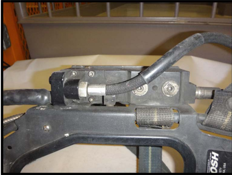
Figure 19: Bottom view of pressure reducer assembly