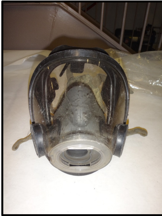
Figure 5: Overview of facepiece