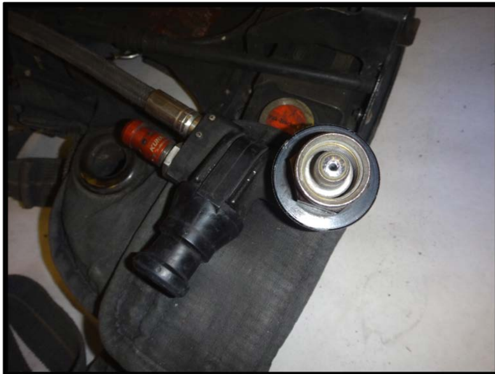
Figure 20: Cylinder attachment and O-ring clean