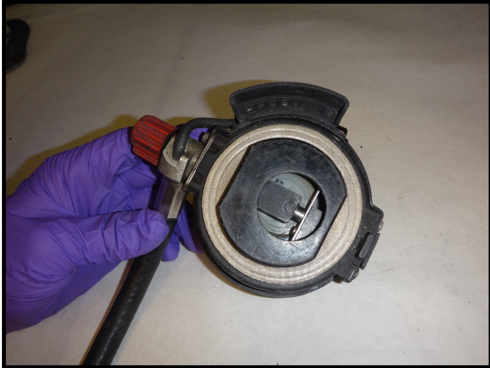
Figure 15: MMR seal and HUD