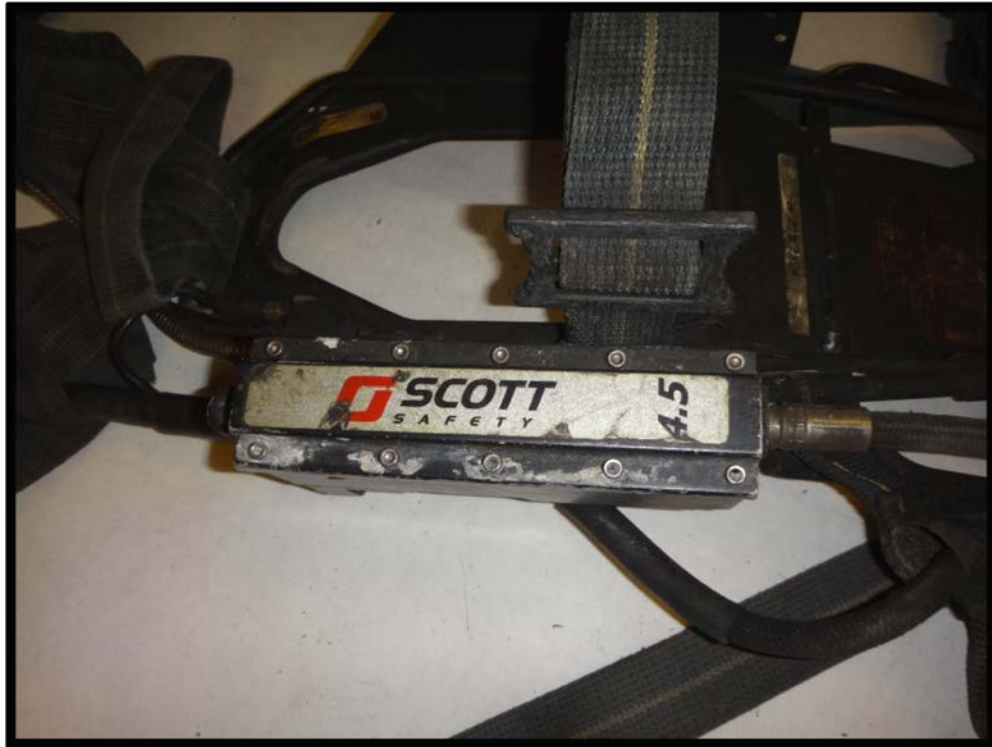
Figure 17: Top view of pressure reducer assembly