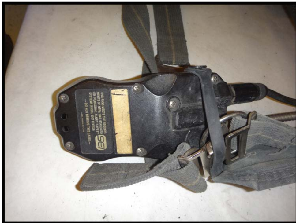
Figure 24: Back of PASS console