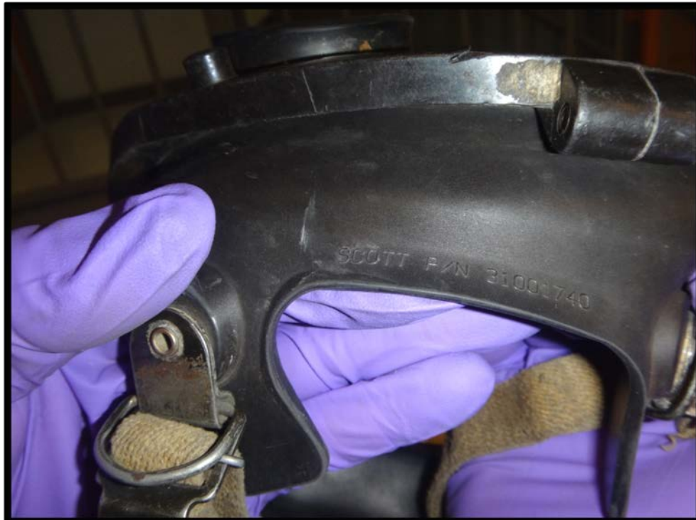
Figure 7: Facepiece seal P/N