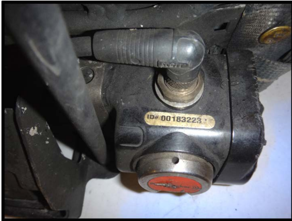
Figure 27: PASS control module ID#