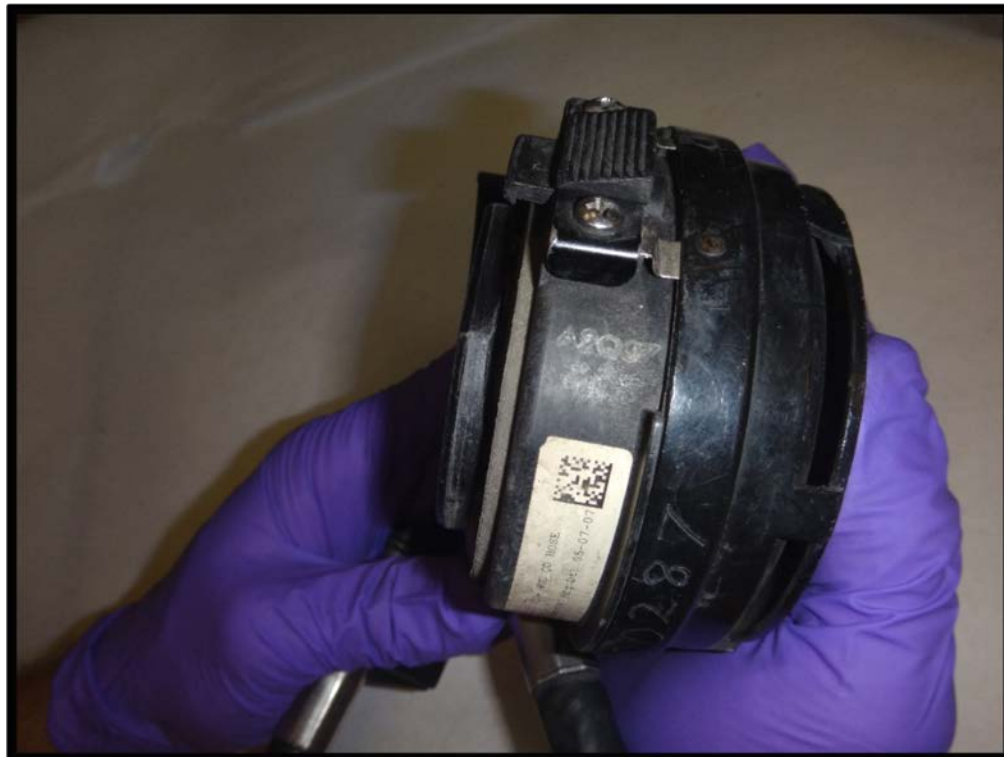
Figure 14: Additional etching on MMR