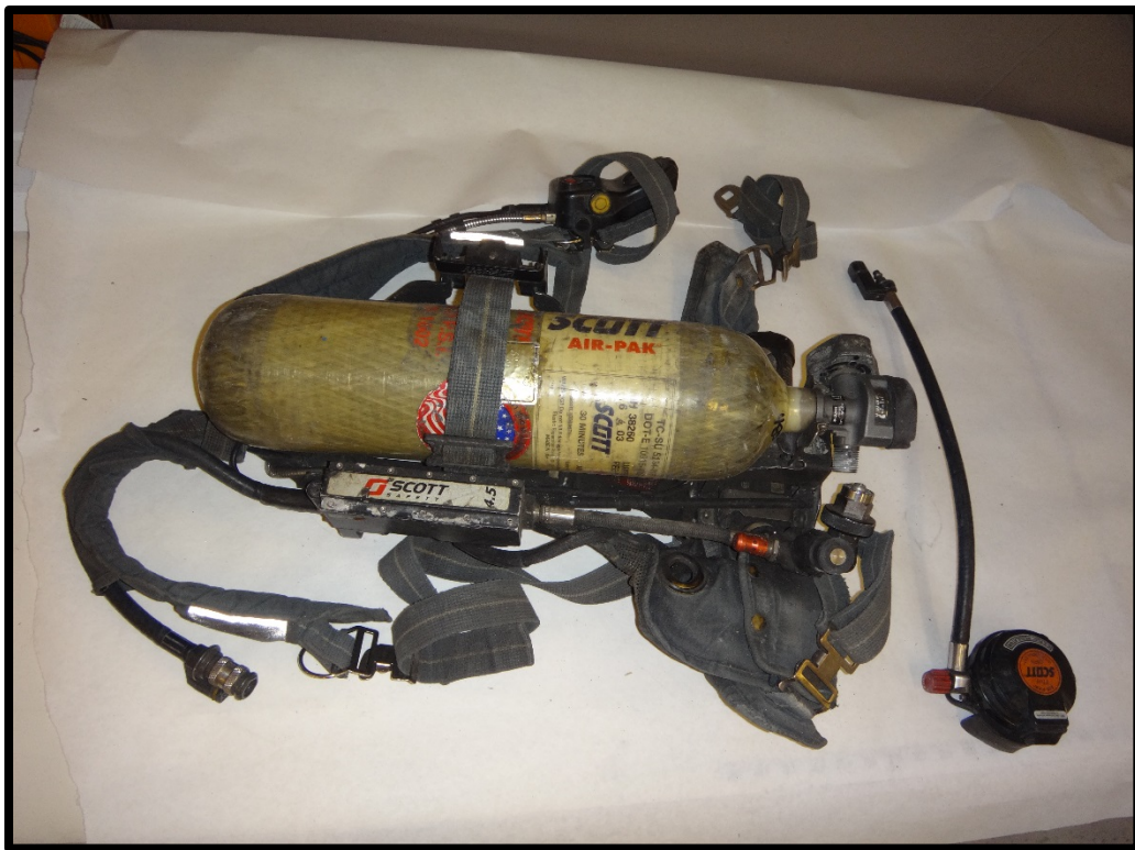
Figure 4: SCBA unit as removed from packaging