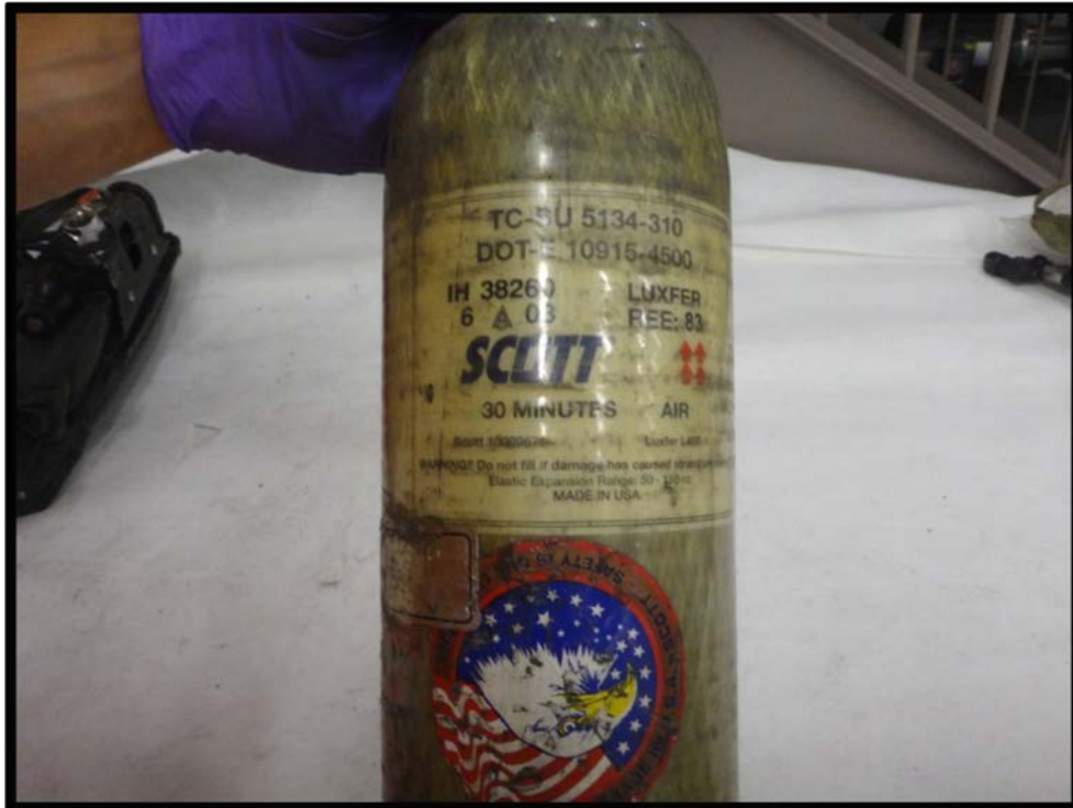
Figure 37: Cylinder label and other markings