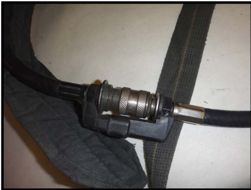
Figure 16: Low pressure line and quick disconnect clean and functional