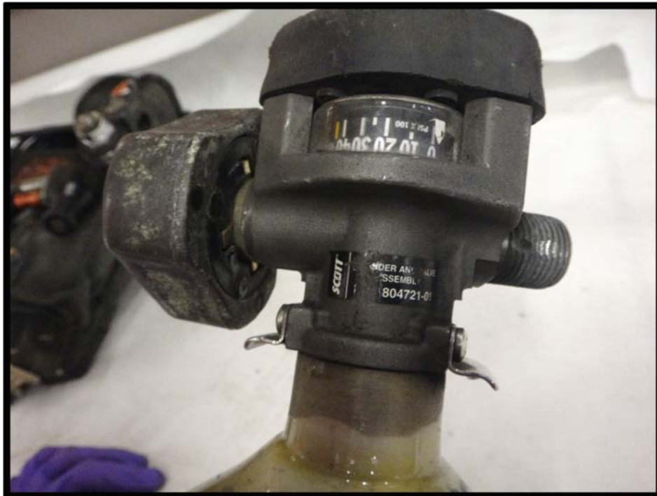
Figure 36: Cylinder gauge is readable