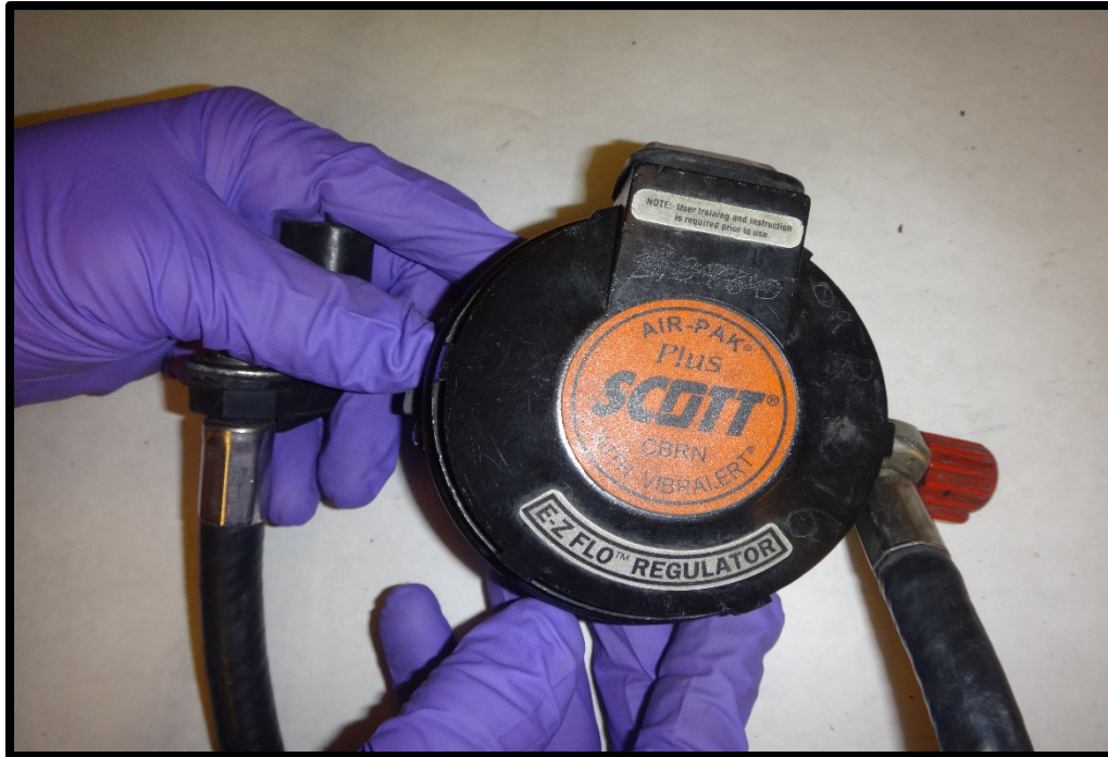
Figure 13: Etching on MMR