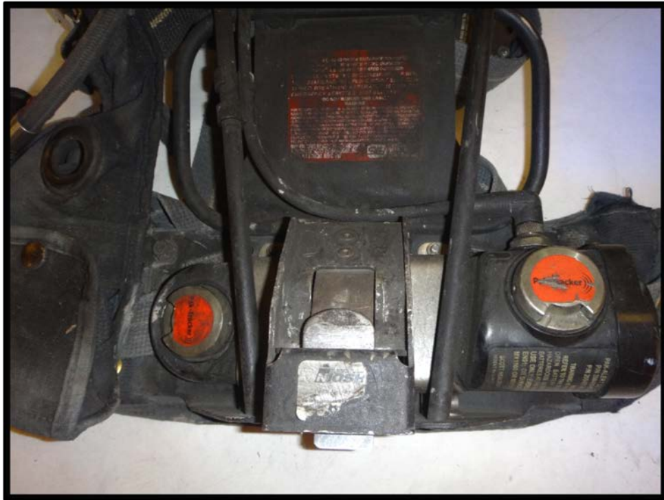
Figure 25: PASS module with Pak-Tracker