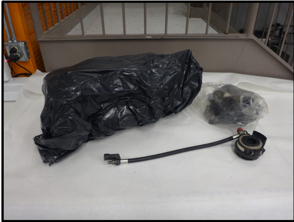
Figure 3: SCBA unit as removed from shipping box