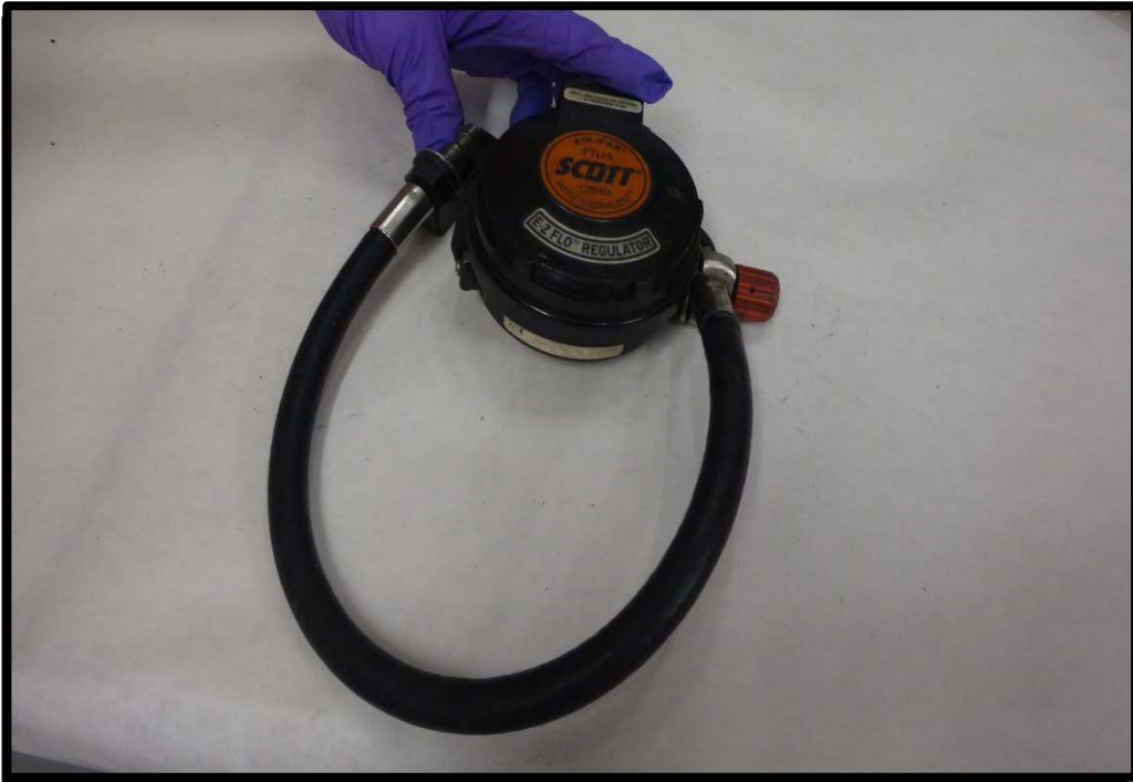
Figure 11: Mask Mounted Regulator (MMR)