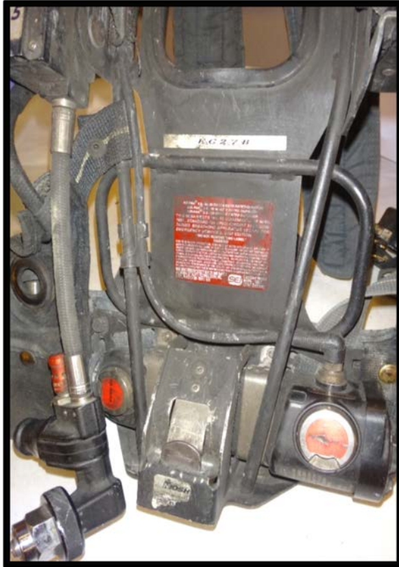
Figure 31: Manufacturer label present