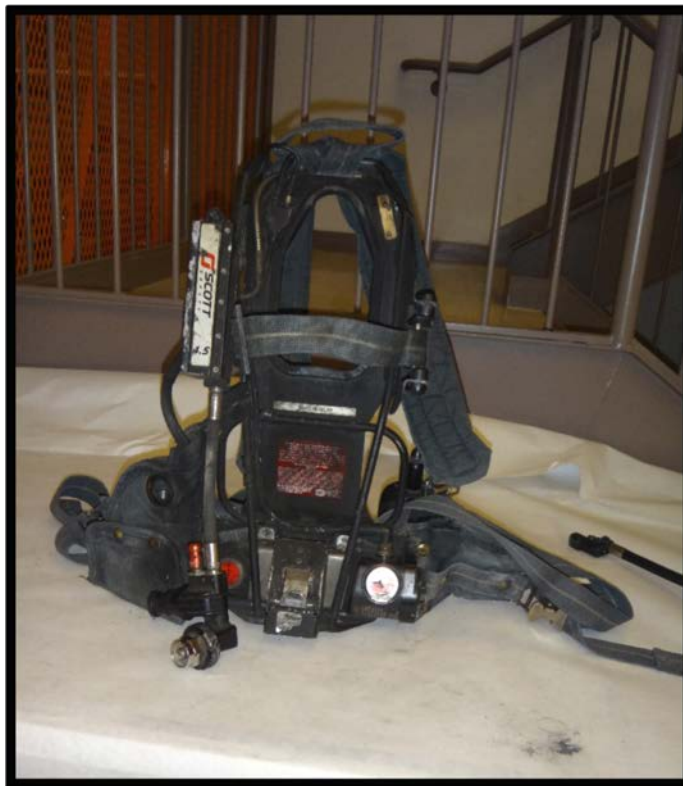
Figure 28: Overview of backframe