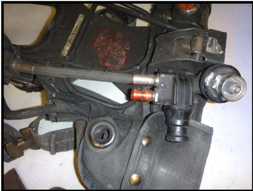
Figure 21: Quick fill overall condition is good