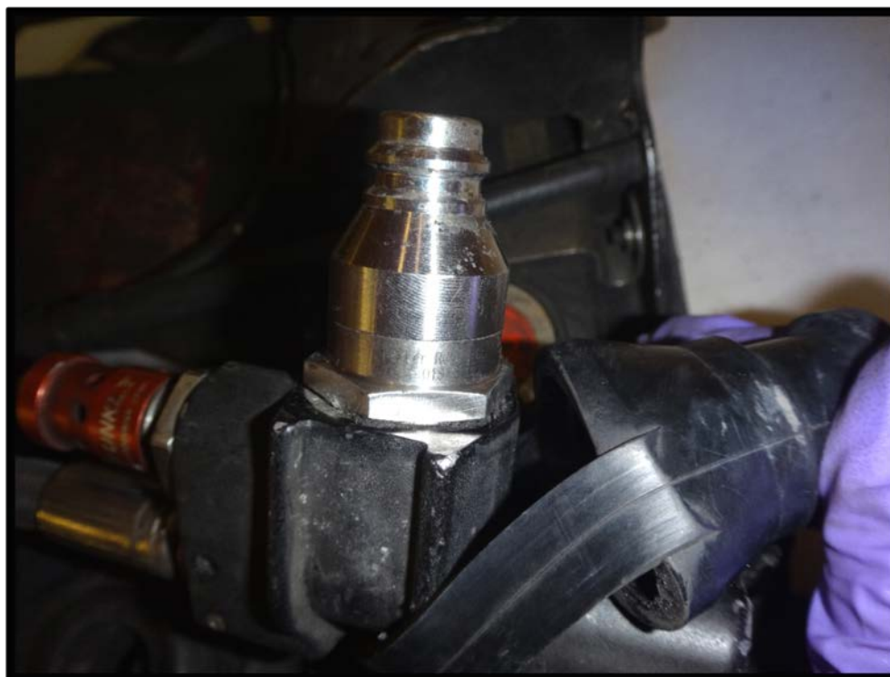
Figure 22: Quick fill with cover removed