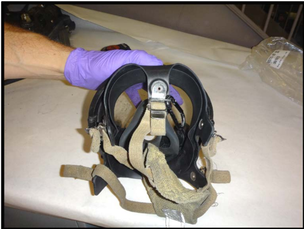
Figure 6: Hairnet straps good/carabiner attached to top adjustment strap