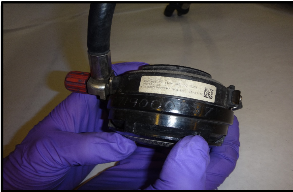
Figure 12: Label and marking on MMR