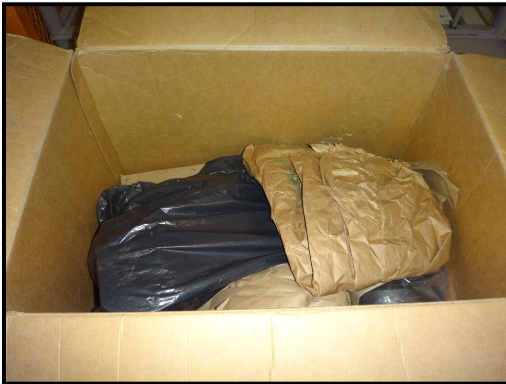
Figure 2: SCBA unit in plastic bag inside box