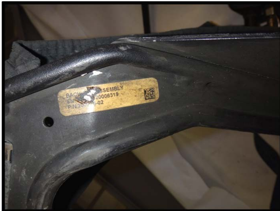
Figure 32: Backframe assembly P/N