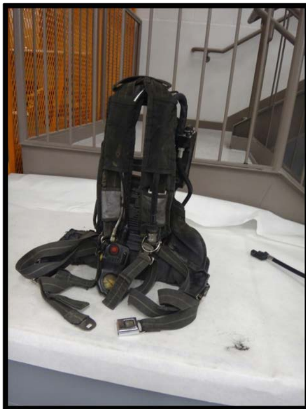
Figure 33: Overview of straps and buckles