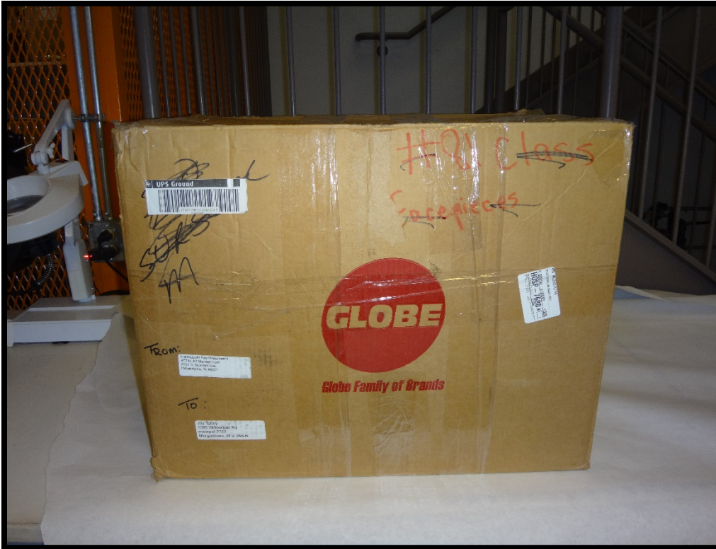
Figure 1: SCBA as received in cardboard box