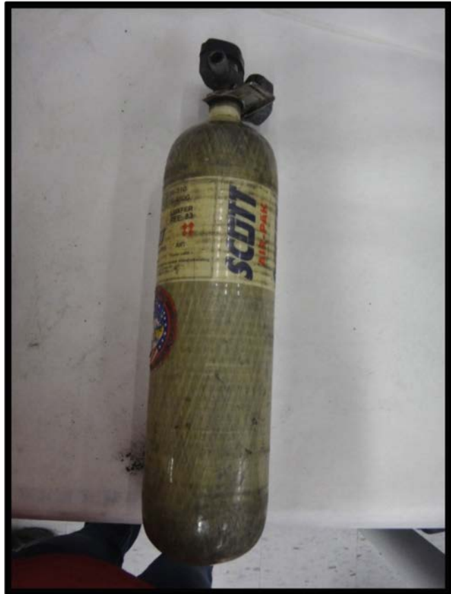
Figure 35: Overview of cylinder