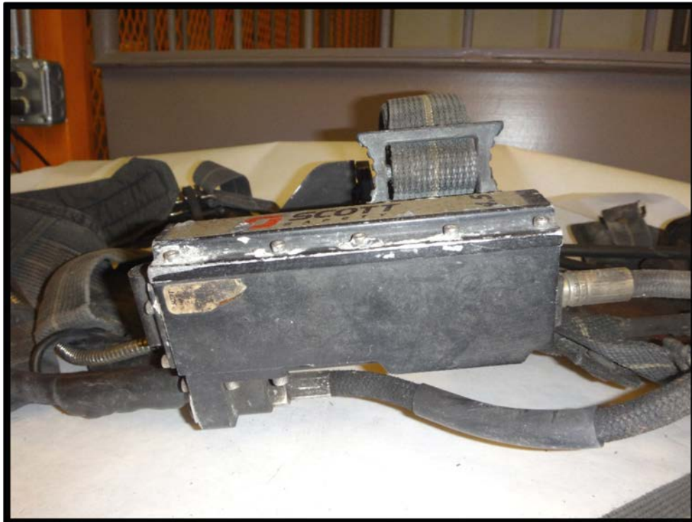
Figure 18: Side view of pressure reducer assembly