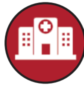
Hospitalization and Surgery